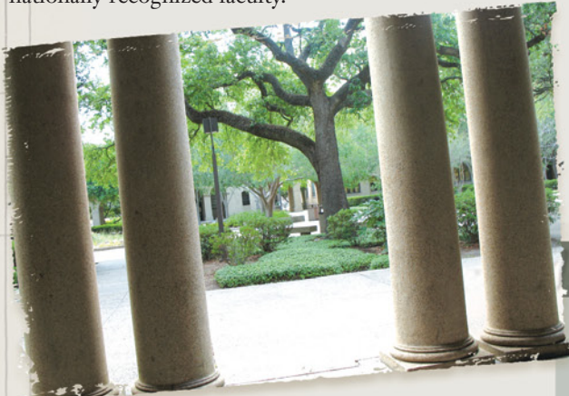
View of LSU Quad

Extensive evaluations of each faculty member are conducted to assure that the most current and effective teaching techniques are employed in the classroom. The School's informal learning environment provides the student ample opportunities to discuss banking topics with its nationally recognized faculty.